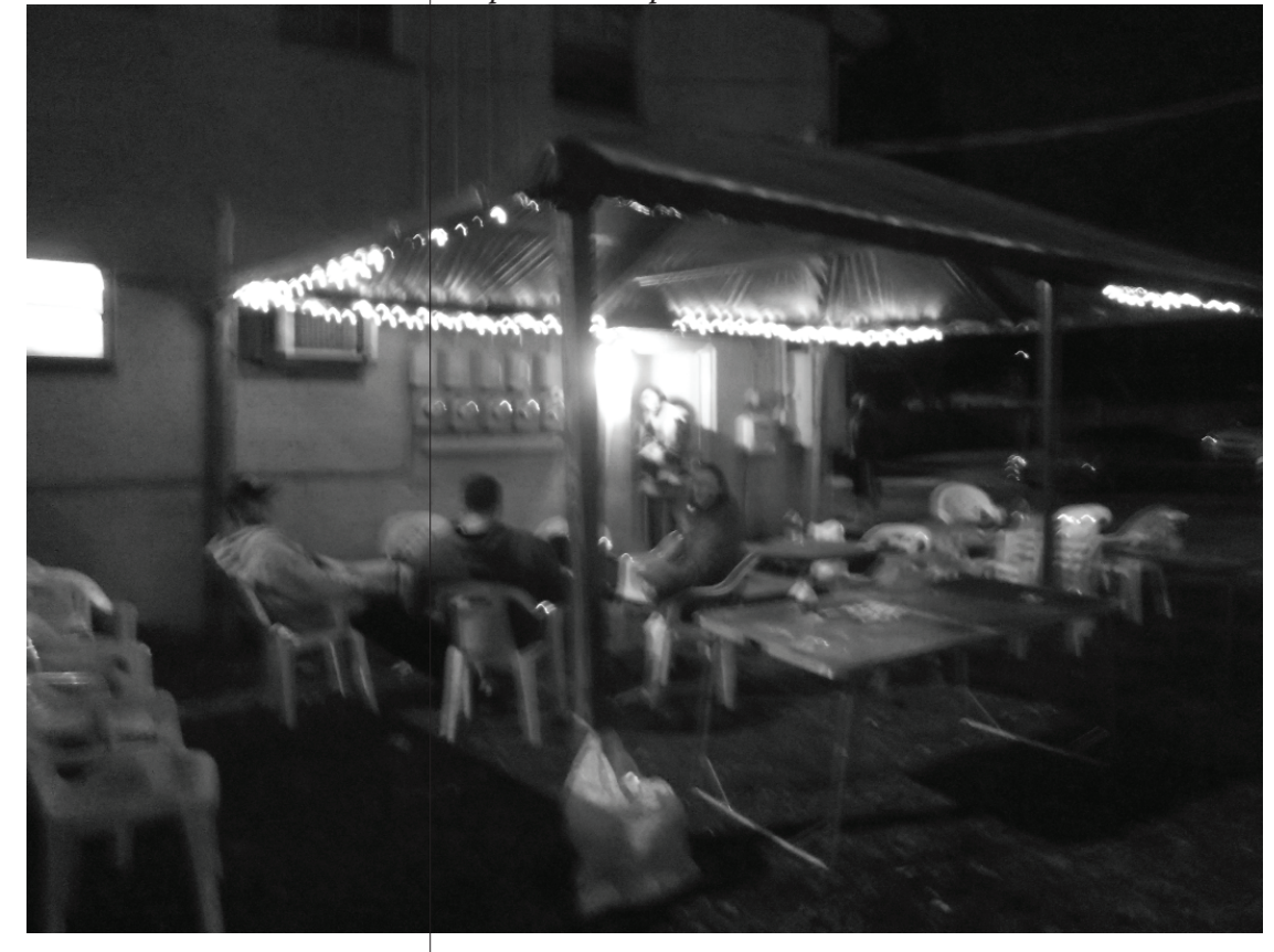
—Cont'd. p. 6

The rats, its location on Nebraska Avenue, and the often non-working toilet made The Meeting Place less intimidating for me. It was right there on the front line; in the trenches. Often, active addicts would nod out during the meetings or prostitutes would come in to take a break and hear the message; a message that was and